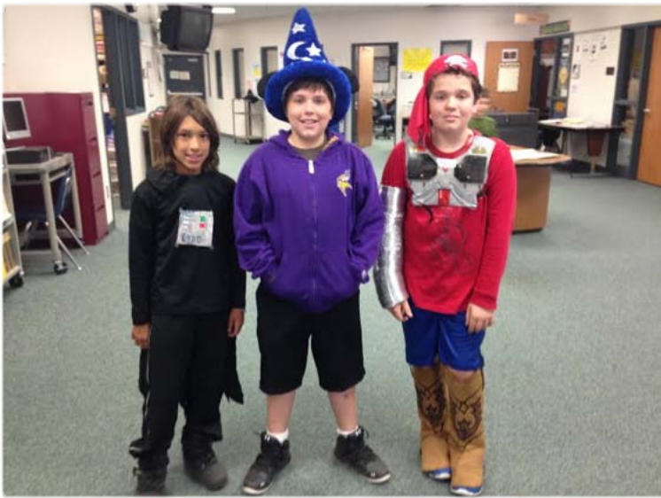
5th graders dressed up for movie character day during Spirit Week