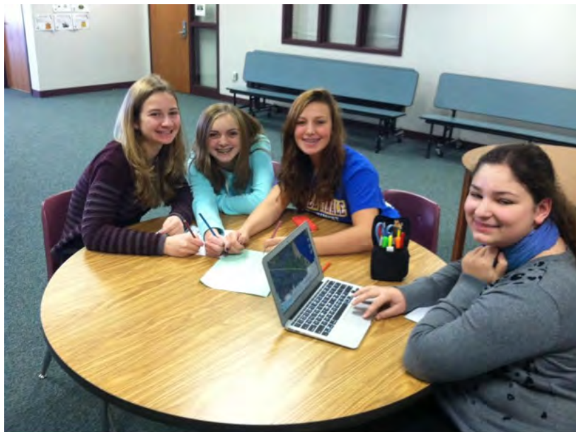
8th grade students designing virtual cities using Sims Software